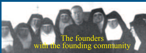
The founders with the founding community

Thus, on October 12, 1956, the new "convent" would be inaugurated.