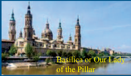
Basilica or Our Lady of the Pillar

From 1950, when the diocesan approval was granted, the number of vocations kept increasing in the Congregation of Oblate Sisters of Christ the Priest. It