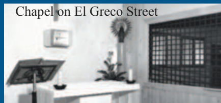
Chapel on El Greco Street

In 1966, they had to move to a house on El Greco street. In 1995, they moved again to a new monastery, built in the Montecanal residential area. This one had to be closed in 2003, after the death of the Servant of God.