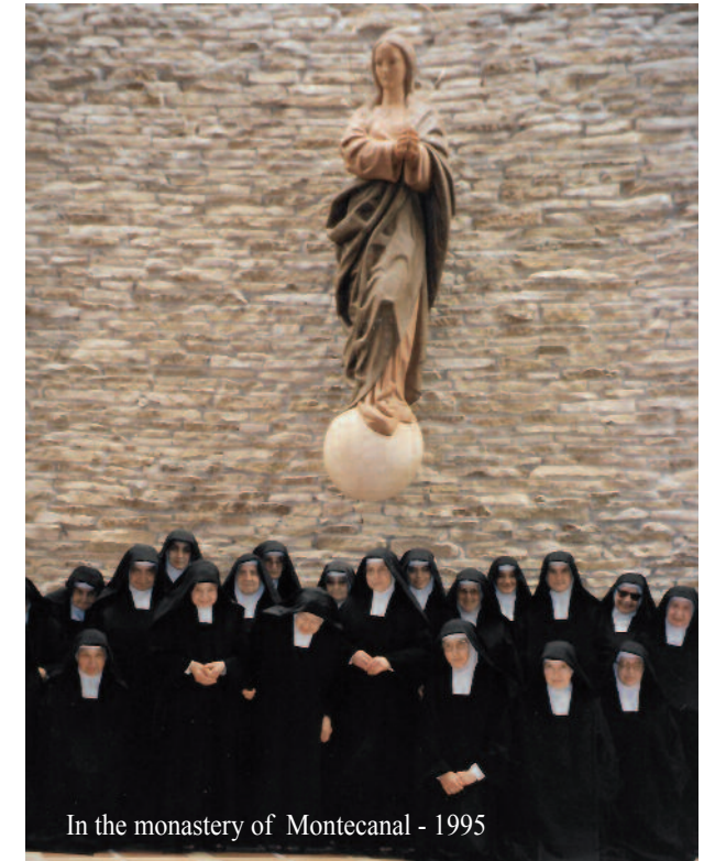
In the monastery of Montecanal - 1995

On July 10, 2019, the Congregation for the Causes of Saints opened the diocesan acts of the cause of beatification and canonization of the Servant of God Maria del Carmen Hidalgo de Caviedes. With this opening began the different phases of the process in the Vatican.