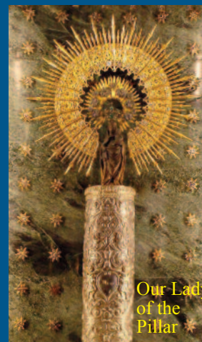
Our Lady of the Pillar