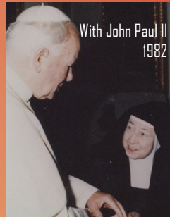
With John Paul II 1982