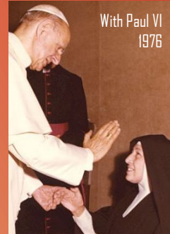
With Paul VI 1976