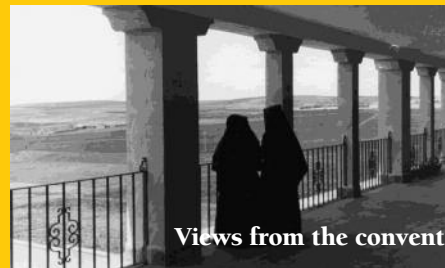
Views from the convent

Still it took another seven years to reach the completion of the building, with the well known obstacles and economic hardships. In all this, Mother M a del Carmen admires the tireless action of Divine Providence: The Providence of God is a wide, inexhaustible river that flows from the immensity of God, but He only lets run a sort of little stream, thin, imperceptible, that winds over the arid field of works. Sometimes it seems to dry, but it never fails to provide the essence to get to the end.