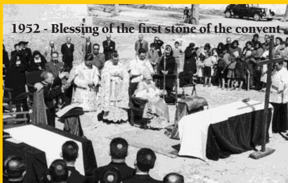
1952 - Blessing of the first stone of the convent

For the temporary convent, two contiguous flats were rented on the upper floor of a residents building, still under construction although practically finished. As the day drew near, the building work was far behind, and the owner of the house, in a hurry, wanted to persuade us to delay the date. We did not give in. And warning and apologizing to the Bishop for the uncomfortable access to the flat—he should climb by stairs under construction—on October 11, 1949, Solemnity of Divine Motherhood of the Blessed Virgin Mary, the Foundation of Salamanca was a fact.