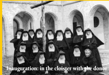
Inauguration: in the cloister with the donor