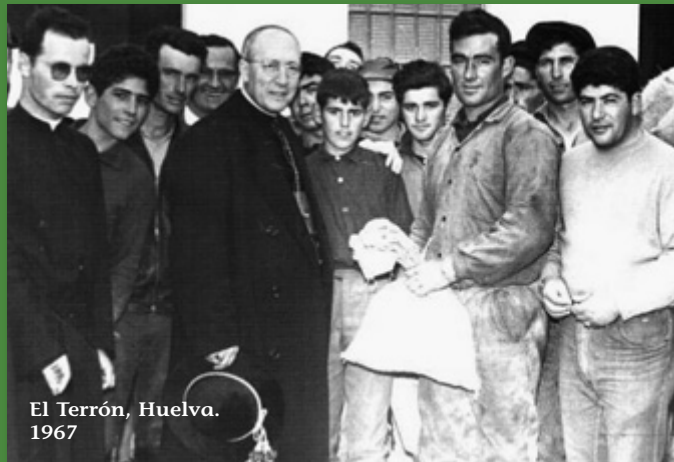
El Terrón, Huelva. 1967