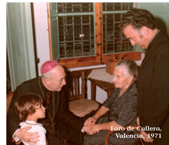
Faro de Cullera, Valencia, 1971

Don José Maria was a mystic. He always looked attentive to God; God's presence was palpable in him. And as he was a real mystic, he loved God and loved people. This was noticeable a mile away. The first impression you had when you approached him was you were loved. Don José Maria was not a man of rivalries for leadership or tensions or clashes or disputes. His great leader was love. Did not the Lord examine Peter on this subject of love before entrusting him the government of his Church? We all know from experience that it is easier to govern by loving rather than by imposing one's will. This is what really convinces. The government within the Church is similar to the government of a father within his own family. Jose Maria governed this way. With love —something that we have almost forgotten—, many more problems may be solved rather than with discussions, confrontations and desires of leadership. These words of mine are enough to show my admiration toward the one who has been —in my view— a great saint and who, from now, will intercede effectively for us before the Lord.