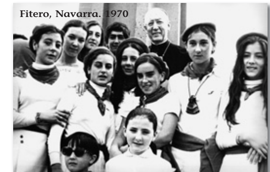
Fitero, Navarra. 1970