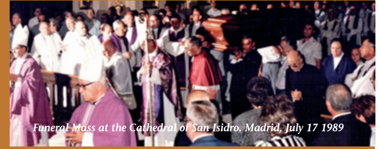
Funeral Mass at the Cathedral of San Isidro, Madrid, July 17 1989