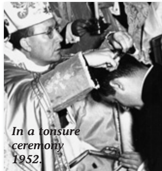
In a tonsure ceremony 1952.

Perhaps one of my greatest joys as Bishop, joy that was repeated for many years, was the opportunity I had to give the priestly orders to several hundred members of Opus Dei. I've always seen them with much doctrine and a deep life of piety, ready to exercise their ministry in all parts of the world.