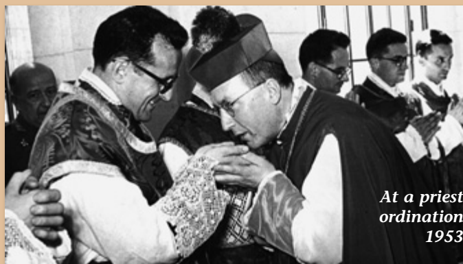
At a priest ordination 1953

With the occasion of Don Alvaro del Portillo beatification, we want to highlight the deep friendship that Venerable García Lahiguera had with the new Blessed. Their relationship was mediated by the figure of St. Josemaría Escrivá, of whom Msgr. G a . Lahiguera was confessor for several years. Blessed Alvaro del Portillo helped Oblate Sisters of Christ Priest founders to fulfill roman procedure needed to get the approval of their Congregation. Therefore, the Venerable G a . Lahiguera even says: "Truly the Lord has linked us; and you will pass to our history as the distinguished benefactors of this humble Congregation."