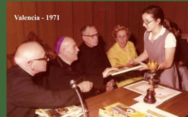
Valencia - 1971