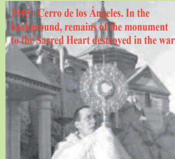
1945 - Cerro de los Ángeles. In the background, remains of the monument to the Sacred Heart destroyed in the war