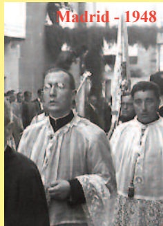
Madrid - 1948