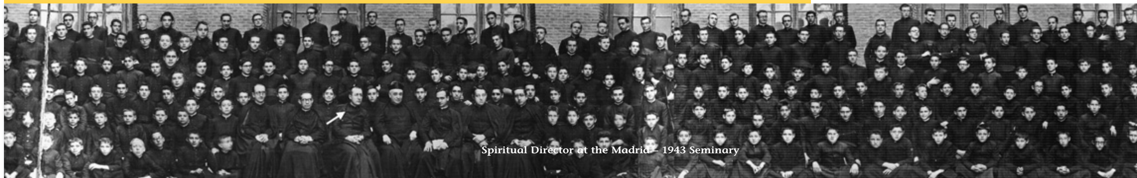
Spiritual Director at the Madrid - 1943 Seminary